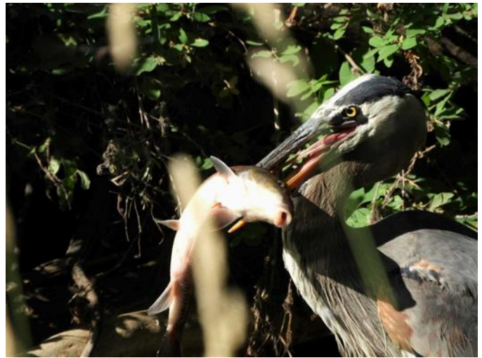
Great Blue Heron with catch, 7-9-2020