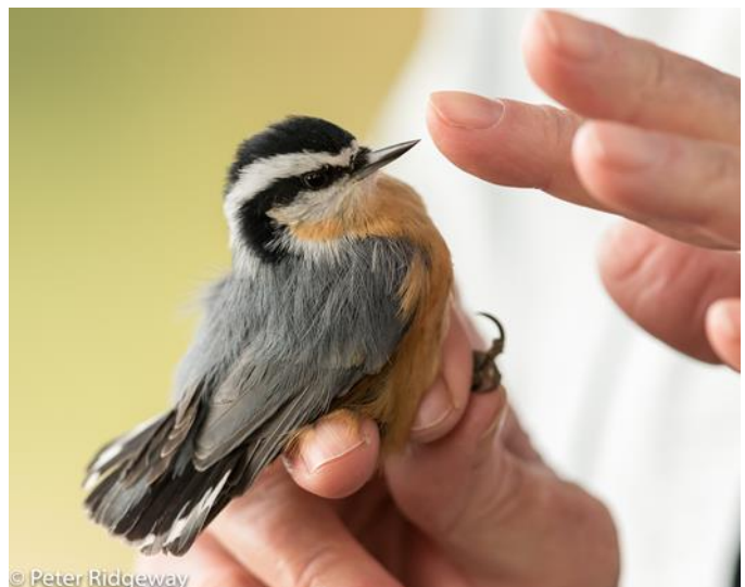
Red-breasted Nuthatch at the Barr Lake banding station, 8-19-2020