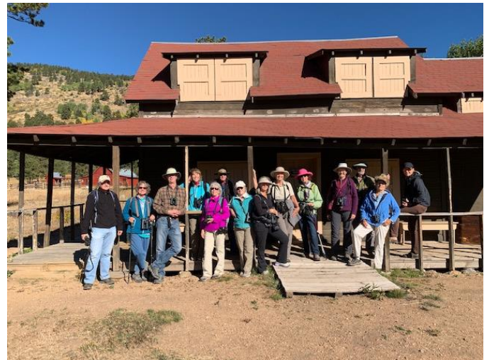
What a difference a year makes!!! Here's a photo of the Boulder Bird Club members at Caribou Ranch in the Fall of 2019...