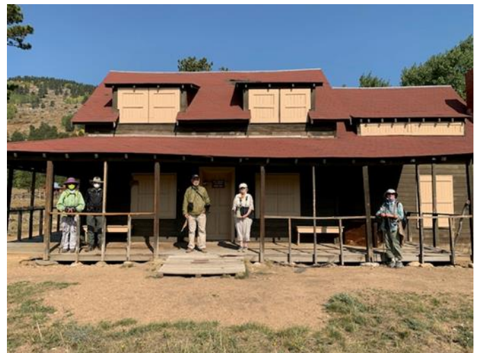
...and here are the Boulder Bird Club members at Caribou Ranch in the Fall of 2020. Group size limited to 6 people: 5 in photo plus one photographer.