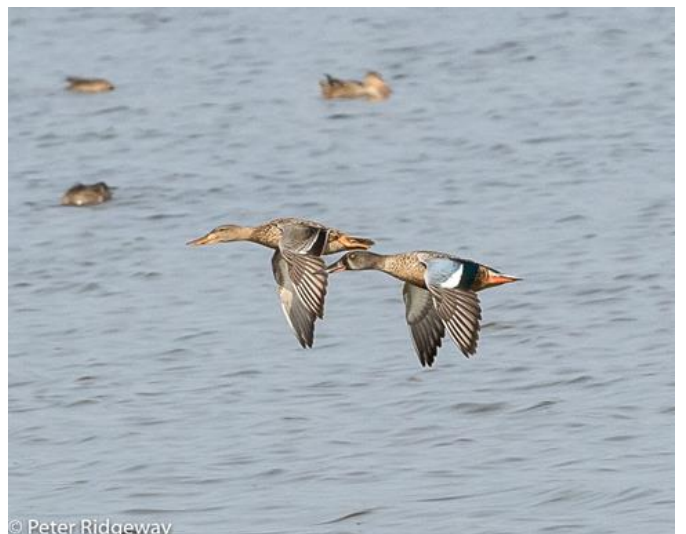
Northern Shoveler pair, Barr Lake, 8-19-2020