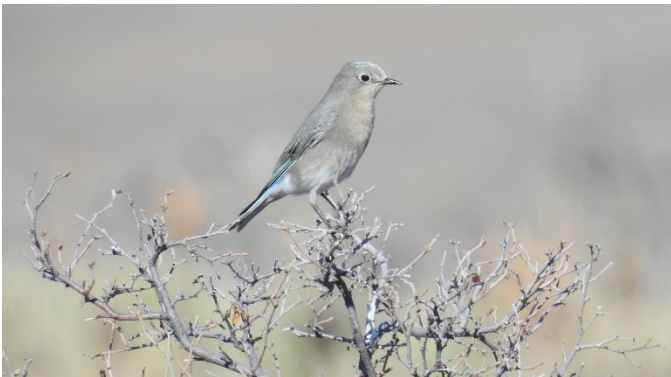
Female Mountain Bluebird, Sage Trail