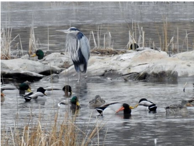
Great Blue Heron with ducks, White Rocks Trail

Leader: Dick Pautsch 303-818-5711 rjpautsch@gmail.com We will drive up Flagstaff Road about 7 miles to the Myers Gulch trail head. Meet at East Boulder Rec Center at 7:30 am.