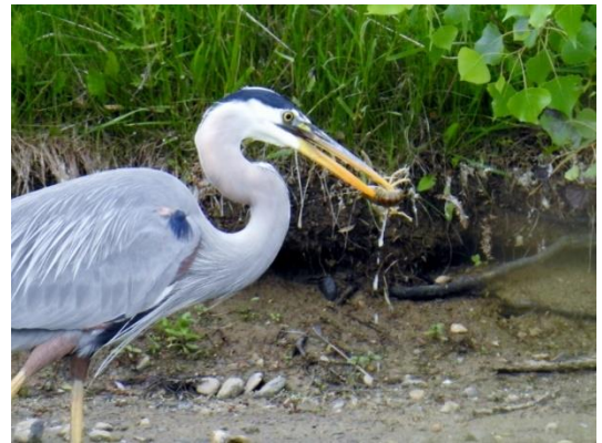
Great Blue Heron – Stearns Lake – 6 26 2019