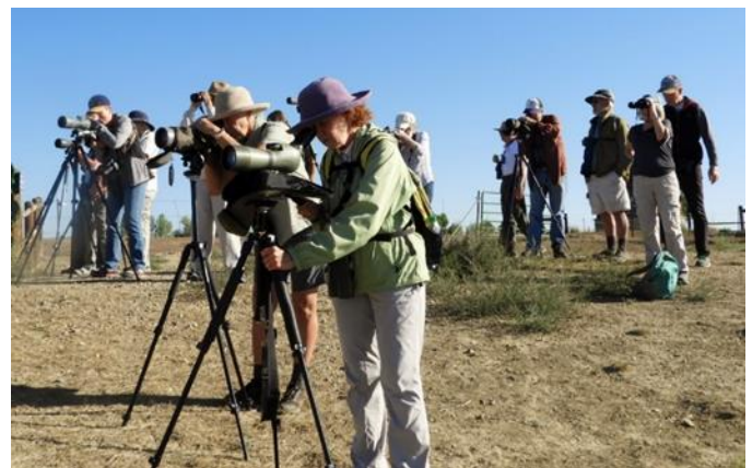
BBC scoping Lagerman, 8-28-19