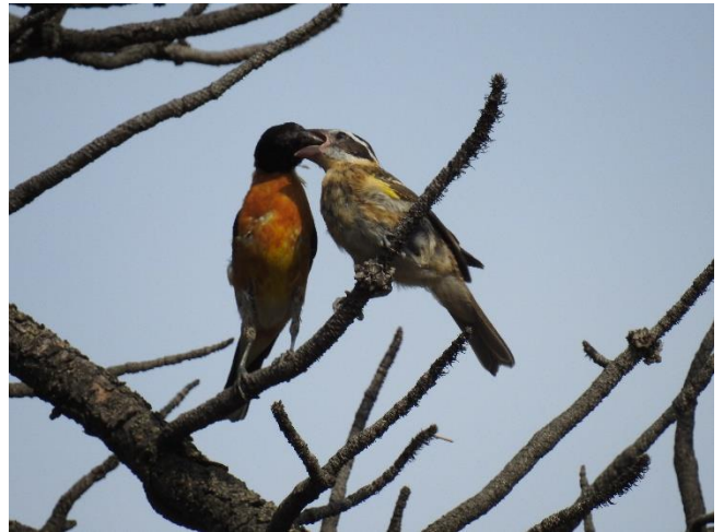
Black-headed Grosbeak feeding juvenile 8.1 2018 Skunk Canyon Trail