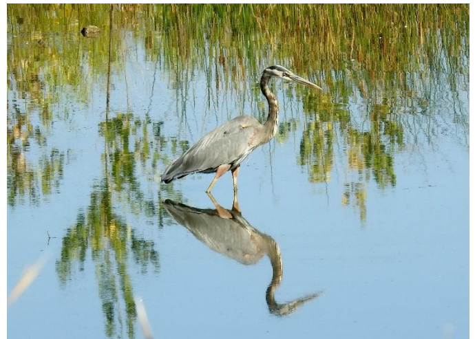
Great Blue Heron, Cottonwood Marsh, Sept. 12, 2018

Bring a little money to chip in for carpooling if warranted, and to buy yourself a cup of coffee afterward. Most trips return to the East Boulder Rec Center parking lot by 11:00 am, then we head to Big Daddy's Bagels in the Meadows Shopping Center for coffee.