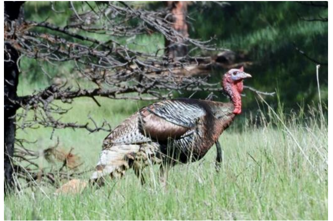
Wild Turkey, Heil Valley Ranch, May 16, 2018

If you are on Facebook, check out the "Boulder Bird Club" page, for photos from BBC trips and more.