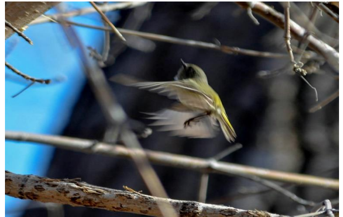
Ruby-crowned Kinglet, Confluence Park 3/14/18