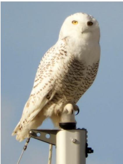
Snowy Owl, January 2018