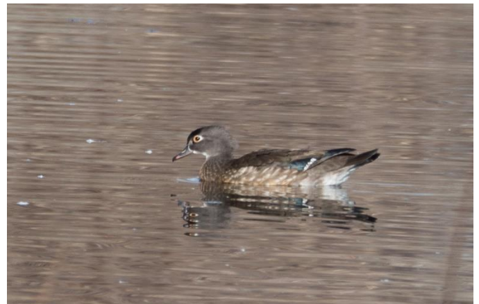
female Wood Duck, Confluence Park 3/14/18, ©Carolyn Beach