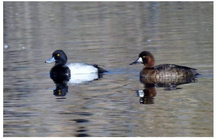
male and female Lesser Scaup, Confluence Park 3/14/18