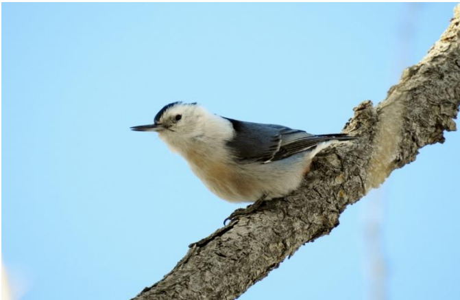
White-breasted Nuthatch, South Boulder Creek 2/14/18