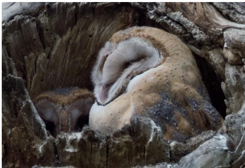
Barn Owl babies