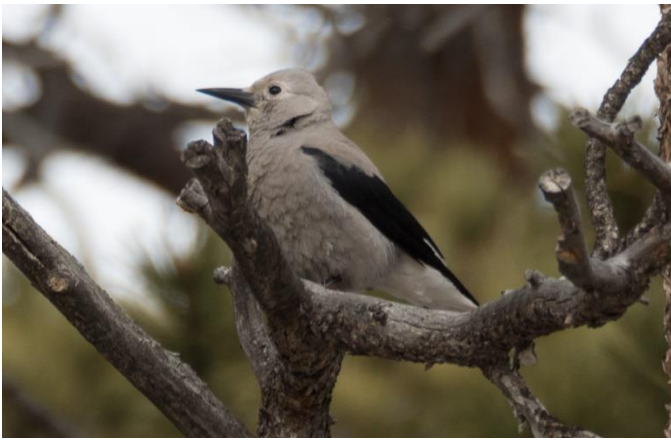
Clark's Nutcracker, Allenspark 1/3/18, ©Carolyn Beach